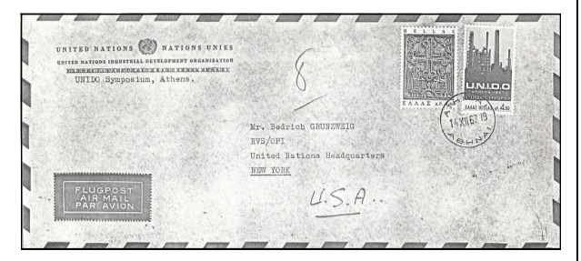
Service cover to UN-New York. 15 Dec. 1967