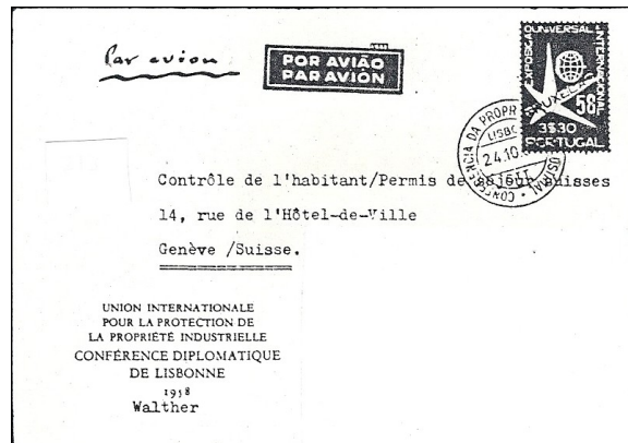
Service cover to Geneva, 24 Oct. 1958

Philatelic cover, $5; Service cover, $40