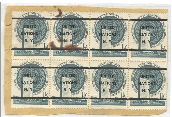
Largest Known Used Block (ex Gaines)

The sale of the UN archives conducted in 2003 by Greg Manning contained no precancel material. All archival material related to the precancel is held by the UN at its philatelic museum in Geneva, Switzerland.