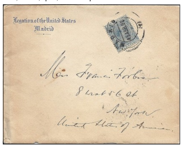
Service cover from US Delegate to Conference, Francis Forbes, Postmarked Madrid, 15 Apr. 1890

P1890/1 Diplomatic Conference on False & Misleading Indications of Source, Madrid, Spain, ended 14 Apr. 1890